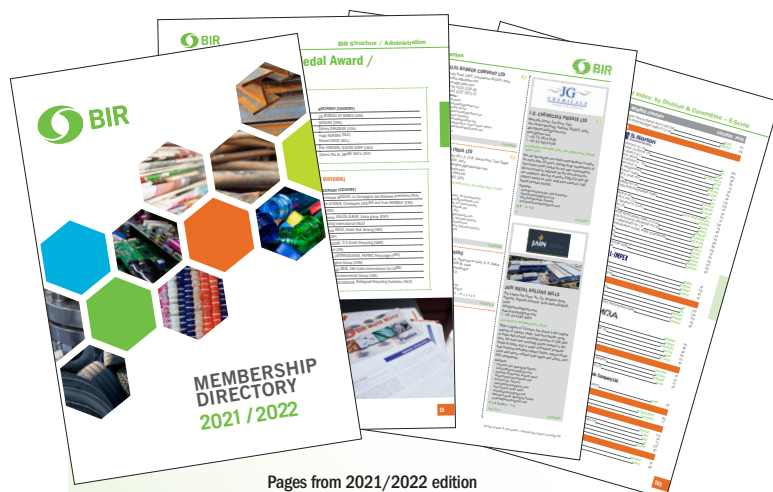
Pages from 2021/2022 edition